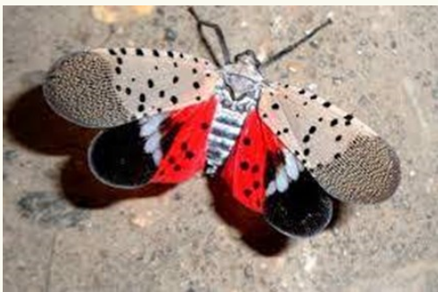
ADULT SPOTTED LANTERNFLY

All agricultural businesses working within the quarantine areas, that move between or out of these areas, are required to have an SLF Permit. One can be obtained at slfpermit@pa.gov . It is extremely important that they are not being transported. Sightings can be reported by calling 1.800.422.3359 or online at https://extension.psu.edu/have-you-seen-a-spotted-lanternfly .