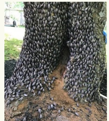
SWARM OF SPOTTED LANTERNFLIES